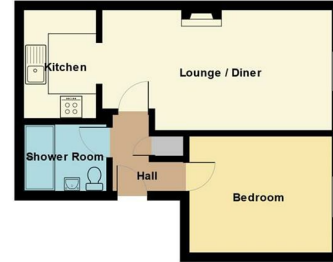
24, The Homestead, Henry Street, Lytham St Annes, FY8 5LJ

John Ardern & Company for themselves and their clients declare that they have exercised all due diligence in the preparation of these details but can give no guarantee as to their veracity or correctness. Any electrical or other appliances included have not been tested, neither have drains, heating, plumbing and electrical installations. All purchasers are recommended to carry out their own investigations before contract. Details Prepared November 2024